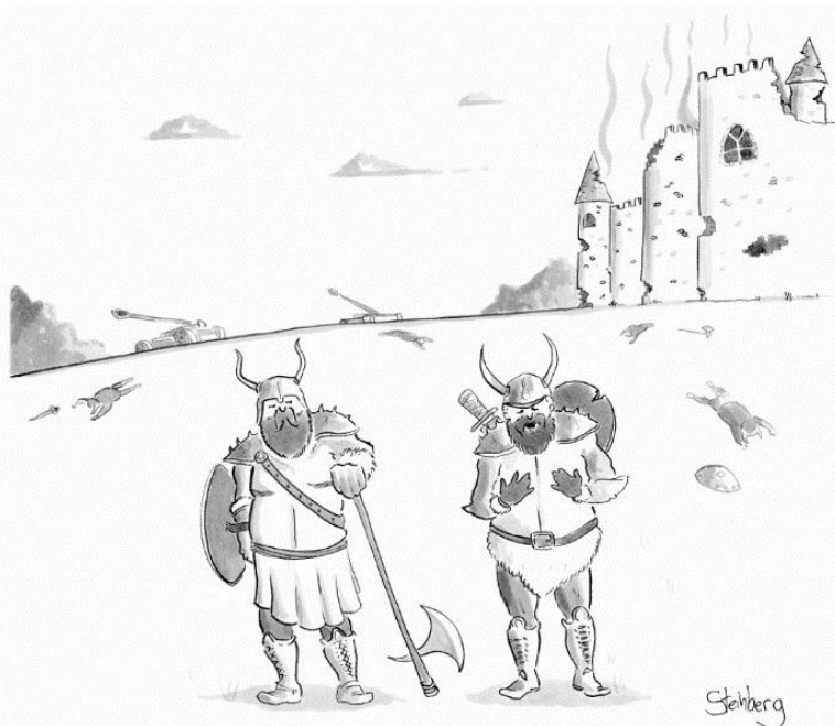
"Do you have any hand sanitizer?"

On the wall on either side of the altar,